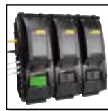
Easy to Expand