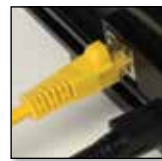
Easy to Network